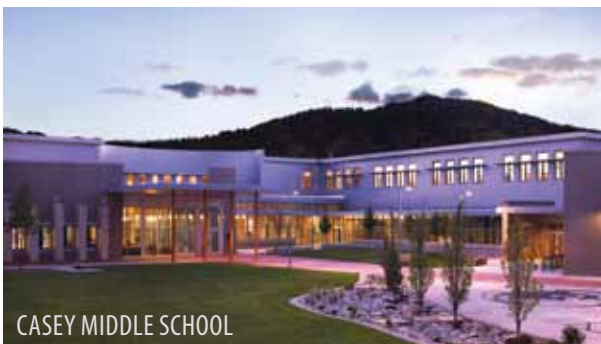
CASEY MIDDLE SCHOOL