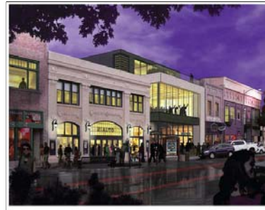
NEW ACT - The Rialto Bridge Project is a public/private partnership to provide the Rialto Theater in Loveland with some much needed space. The $4 million project will provide a green room, dressing rooms, staging space, elevator and stage redwood.

In the heart of this arts community is the historic Rialto Theater. The theater, which is on the National Register of Historic Places, continues to thrive as it provides new and unique experiences for its patrons. However, to sustain growth, expansion is necessary and will not only benefit the theater but the region as a whole.