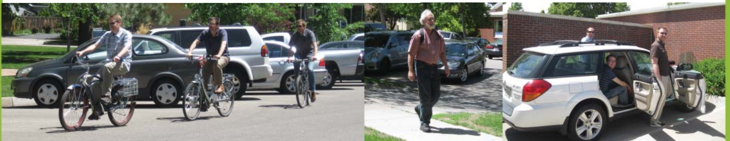
Staff bicycling, walking and carpooling to work.